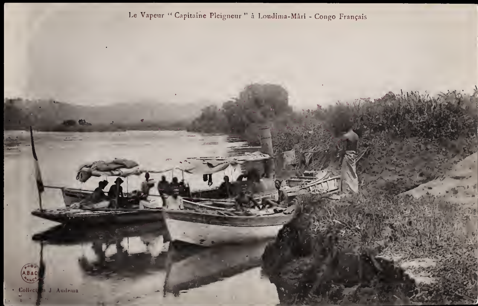
Le Vapeur " Capitaine Pleigneur " à Loudima-Mâri - Congo Français